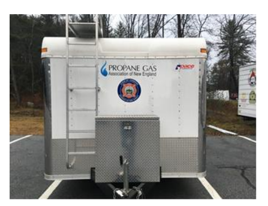
Equipment on board the trailer includes LP Gas Compressors (2), LP Gas Pump, LP Gas Flares (2) with various fittings and hoses, and plug/patching supplies.

The training was a great opportunity for the Team to utilize our LP Gas Response trailer and equipment.