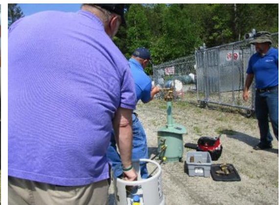
Review of ASME Tank valves and connections Review of underground dome valves and connections