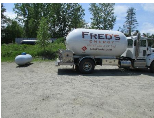
Review of Bobtail apparatus