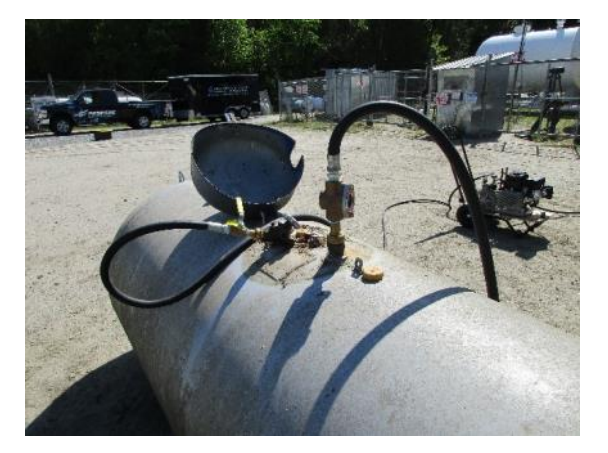
Connections for Transfer of product from container container