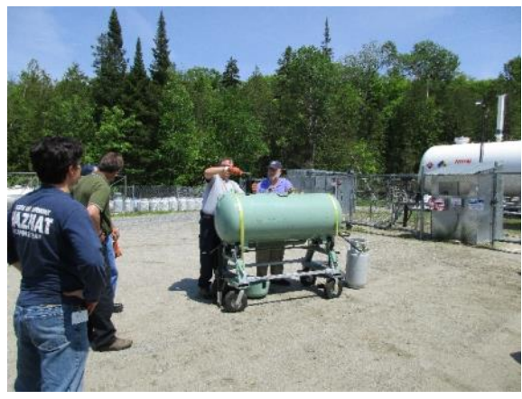
Review of MC331 Transport Trailers